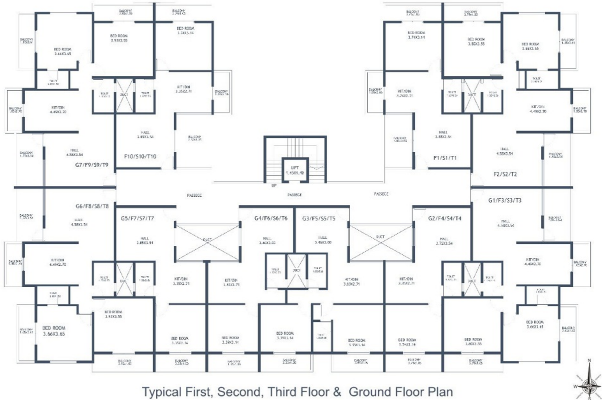
Typical First, Second, Third Floor & Ground Floor Plan